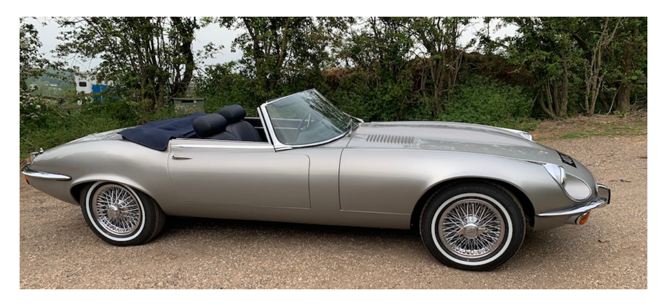
Jaguar Series 3 E-Type (1971-75)

The Jaguar E-Type is the most outrageously stunning car of all time. It is the ne plus ultra of charismatic classics and its story has become part of automotive folklore. When the silken drapes were pulled from its polished bodywork at the 1961 Geneva motor show, it ushered in an era of unprecedented automotive glamour. It was the car the 60s deserved. Now, almost 60 years later, the detail of Malcolm Sayer's exquisite original design still has the power to stop you in your tracks.